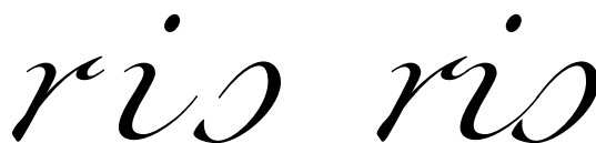
Figure 5: Extended spacing of 5pt and normal spacing

Do not use any condensed nor extended spacing! Miama lives from connected strokes, which are killed as soon as you change spacing.