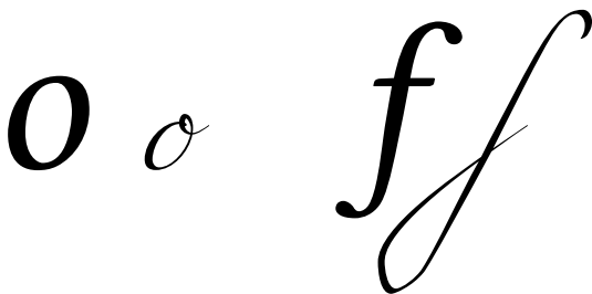
Figure 4: The glyphs o and f of Linux Libertine compared to Miama at the same point size

Miama is a very small typeface compared to other fonts. This is due to the very large ascenders and descenders. So if you want to look Miama as a font of 10pt, choose 15–20pt. Also keep in mind, that Miama then still looks quite light, so you want probably resize it even more for titles.